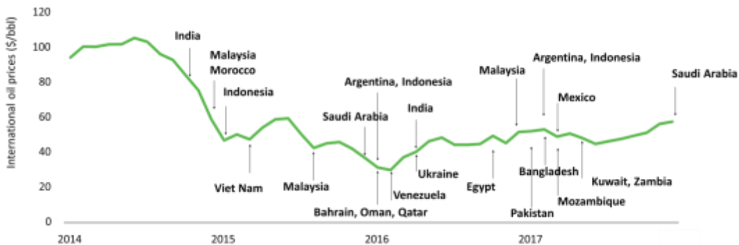
Figure 3. Policy developments to reduce subsidies*

The fall in oil prices in 2014 offered countries an opportunity to phase-out subsidies and many countries across the world have taken this opportunity. In Asia, for example, countries such as India, Indonesia and Malaysia have eliminated subsidies for gasoline. In Latin America, Mexico abolished subsidies for gasoline and started liberalising prices. Argentina also made a drastic reform to raise gasoline and diesel prices, as well as electricity prices. Momentum for reforming subsidies is not limited to net importers of fuels. Oil producing countries in Middle East, such as Kuwait, UAE and Saudi Arabia have also taken steps to reduce subsidies. Countries in Africa have also made progress in reforming subsidies. As such, the momentum to reform subsidies is growing across the world. Recent developments in fossil fuel pricing policies and subsidy reforms are summarised in Figure 2.